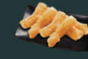
Chinese Dough [370]