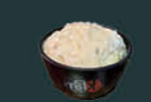
Shrimp Paste [90]