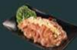
Garlic Chicken (150) Marinated chicken with garlic sauce