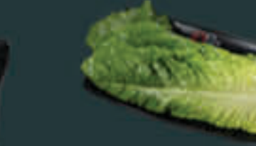
Green Leaf Lettuce [15] G