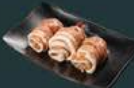
KPOT Pork Belly (340) Marinated premium pork belly