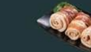
Smoked Garlic Pork Belly (320) Smoked & marinated pork belly with garlic sauce