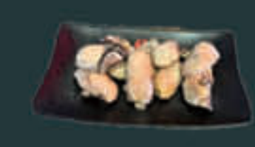
Oysters [60] G