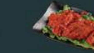
Spicy Fish Fillet (100) Marinated fish fillet with spicy sauce