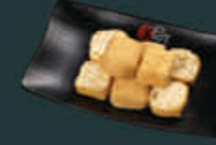
Fried Tofu [230] G