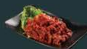
Spicy Beef Bulgogi (200) Marinated beef with spicy sauce