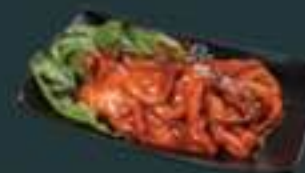
Spicy Baby Octopus (90) Marinated baby octopus with spicy sauce Dinner Item