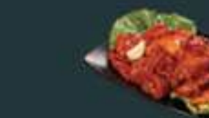
Spicy Chicken Bulgogi (130) Marinated chicken with spicy sauce