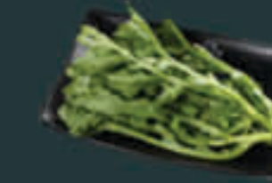
Crown Daisy [20] G