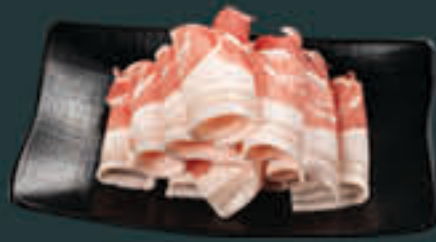
Sliced Pork Belly [330] G