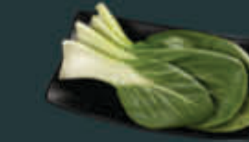
Bok Choy [10] G