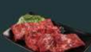
Hanger Steak (220) Dinner Item