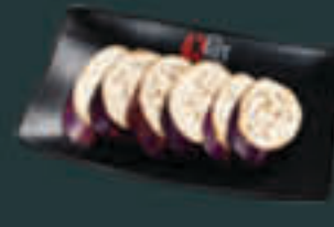
Eggplant [20] G