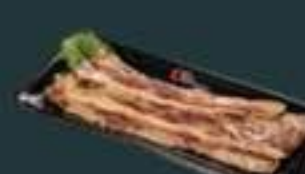
KPOT Short Rib (300) Marinated short rib Dinner Item