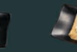
Fried Tofu Skin [270] G