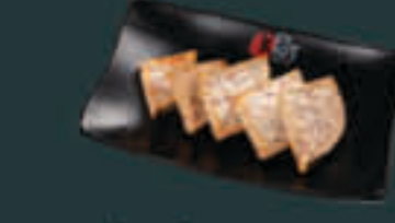
Fried Taro [180] G