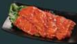
Spicy Salmon (170) Marinated salmon with spicy sauce Dinner Item