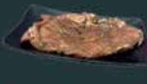
Black Pepper Pork Chop (150)