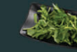
Watercress [10] G