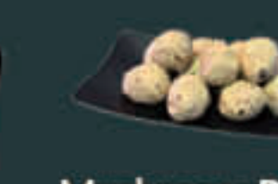
Mushroom Balls [95]