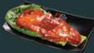
Spicy Calamari (110) Marinated calamari with spicy sauce