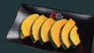
Sliced Pumpkin (20)