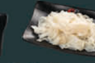
Cattle Tripe [70] G