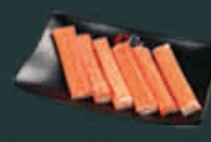
Crab Meat [90]