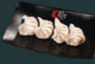
Shrimp Dumplings [170]