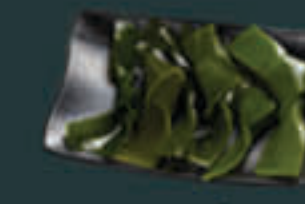
Seaweed Knots [20] G