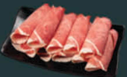
Sliced Ribeye [140] G Dinner Item