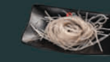
Sweet Potato Noodle [100] G