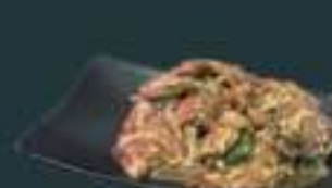
Cumin Lamb (198) Dinner Item