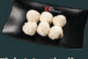
Fish Meatballs [140]