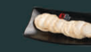
King Mushroom [20] G