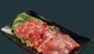
Angus Chuck Flap Tail (240) Dinner Item