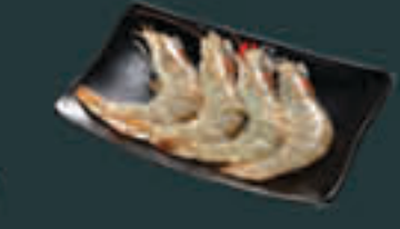
Jumbo Shrimp [90] G Dinner Item