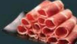
Prime Brisket (230)