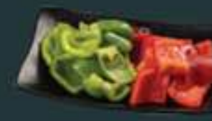
Bell Pepper (25)