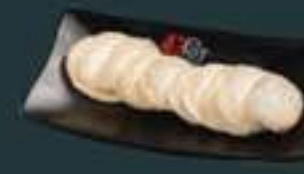
King Mushroom (20)