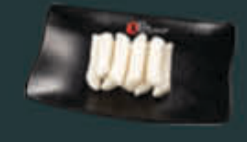
Rice Cake [330] G