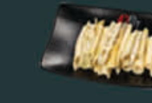
Baby Bamboo Shoot [25] G