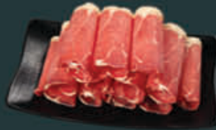
Sliced Lamb [100] G