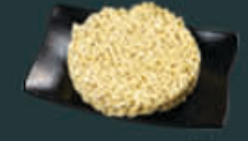
Ramen Noodle [370]