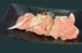
Signature Pork Cheek (220) Dinner Item