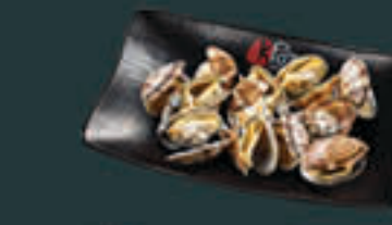
Clams [70] G