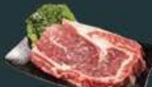
KPOT Steak (280) Dinner Item