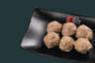
Beef Meatballs [220] Dinner Item