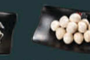
Quail Eggs [140] G