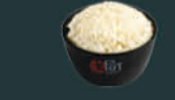
White Rice [110] G