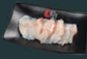
Swai Fish [80] G