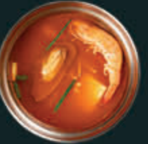
Korean Seafood Tofu