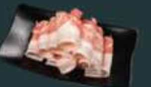
Sliced Pork Belly (330)