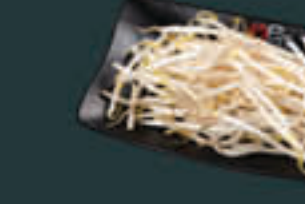
Mung Bean Sprout [25] G