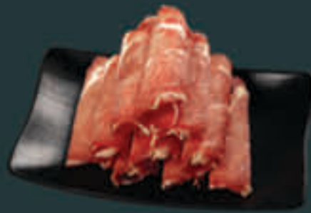
Sliced Pork [150] G