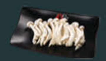
Beech Mushroom [15] G