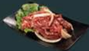
Beef Bulgogi (180) Marinated beef