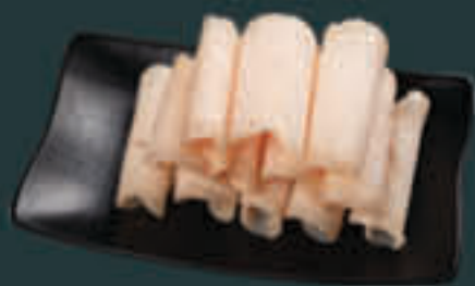
Sliced Chicken [100] G