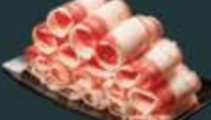
Sliced Beef Belly (260)