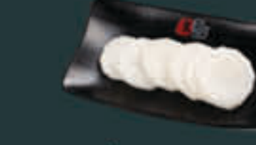
Daikon [15] G