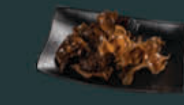
Black Fungus [25] G