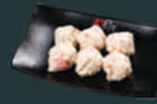
Lobster Balls [150]