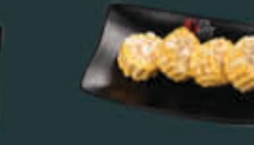
Corn [70] G