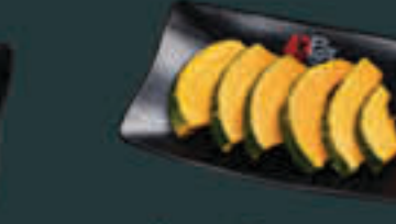
Sliced Pumpkins [20] G