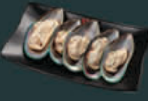
Mussels [80] G