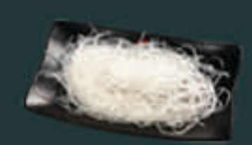
Vermicelli [95] G