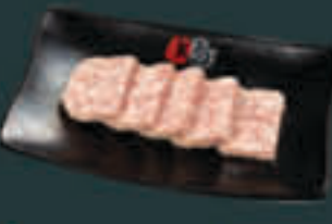
Spam [270] G