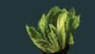
Green Leaf Lettuce (15)