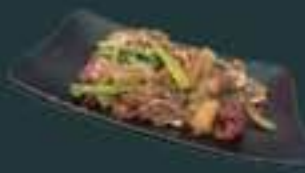
Hawaiian Bulgogi (180)