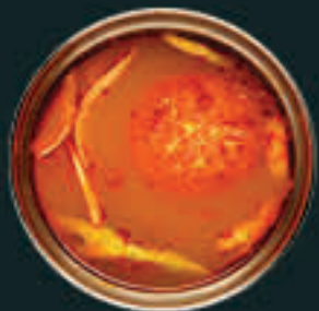
Thai Tom Yum