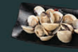
White Clams [70] G