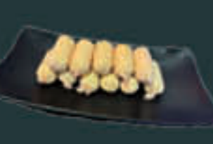
Chicken Sausages [220]