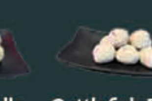
Cuttlefish Balls [200]