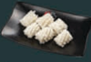
Squid [80] G