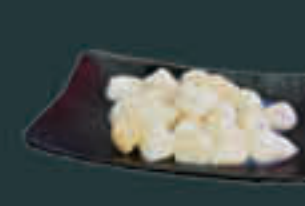
Bay Scallops [112] G Dinner Item