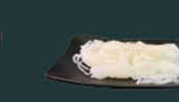
Konjac [35] G