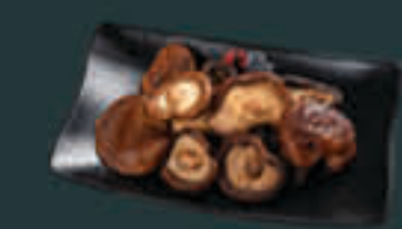
Shiitake Mushroom [30] G