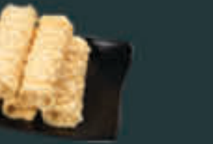
Bean Curd Stick [125] G