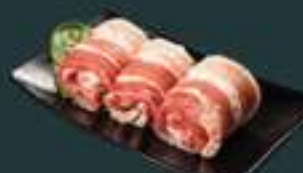
Pork Belly (330) Regular style sliced pork belly