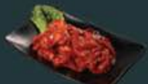
Spicy Pork Bulgogi (210) Marinated pork with spicy sauce