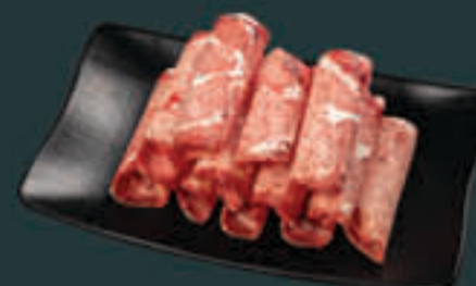
Beef Tongue [190] G Dinner Item