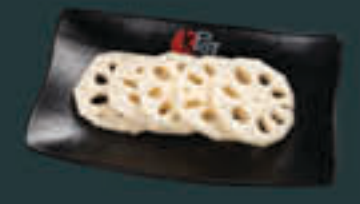
Lotus Root [60] G