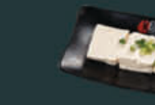
Soft Tofu [45] G