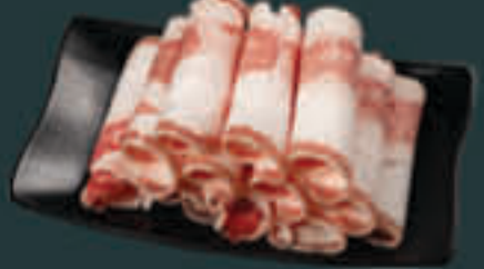
Sliced Beef Belly [360] G