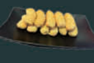
Squid Roll [170]