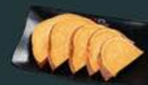
Sweet Potato (70)