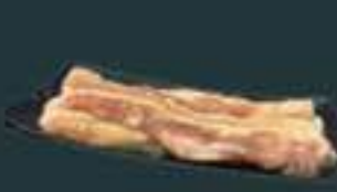
Miso Pork Belly (250)