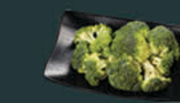
Broccoli [30] G