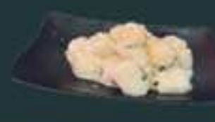
Garlic Bay Scallops (120) Marinated scallops with garlic sauce Dinner Item