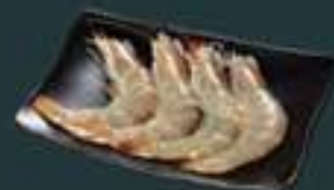
Jumbo Shrimp (90) Dinner Item