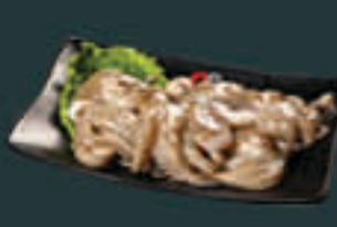
Baby Octopus [90] G Dinner Item