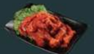
Spicy Pork Belly (330) Marinated pork belly with spicy sauce