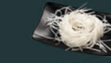
Fresh Pho Noodle [238] G