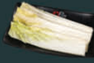
Napa [10] G