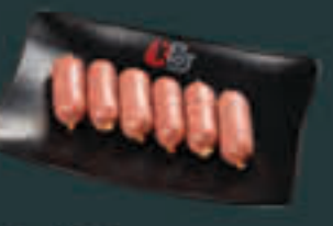
Mini Sausages [250]