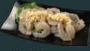
Garlic Shrimp (90) Marinated shrimp with garlic sauce