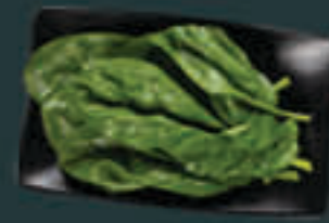
Spinach [20] G