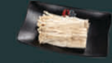
Enoki Mushroom [35] G