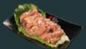
Chicken Bulgogi (120) Marinated chicken