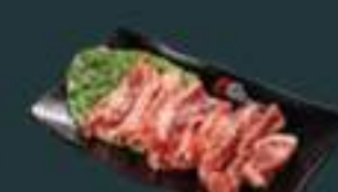
Fingers Ribs (240) Dinner Item