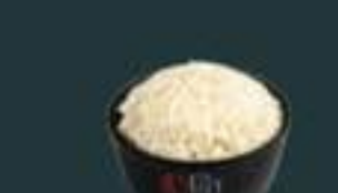
White Rice (110)