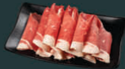
Prime Brisket [230] G