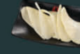
Potato [70] G