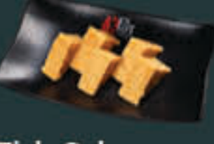
Fish Cakes [70]