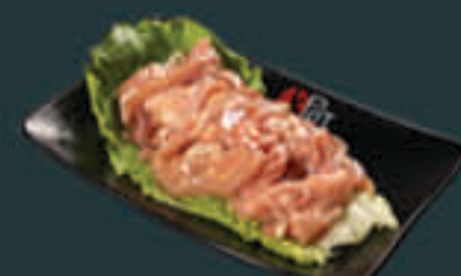
Chicken Bulgogi [120] Marinated chicken