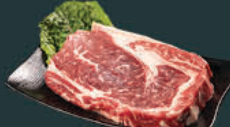
KPOT Steak [280] G Dinner Item