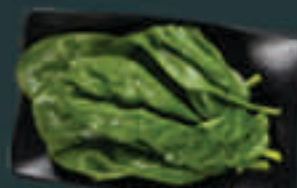
Spinach (20) G