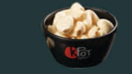
Garlic [130] G