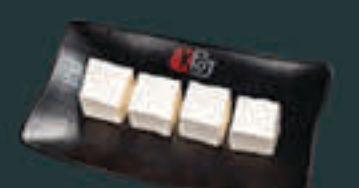
Frozen Tofu (81) G