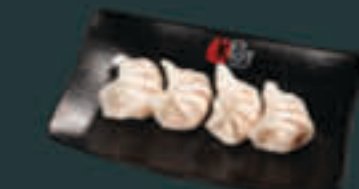
Shrimp Dumplings (170)