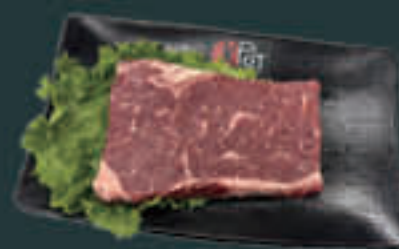
New York Strip Steak [280] G Dinner Item