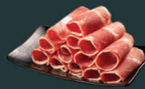
Prime Brisket [230] G