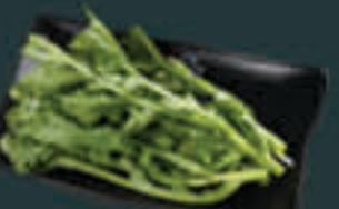
Crown Daisy (20) G