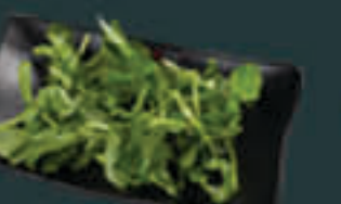
Watercress (10) G