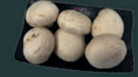
White Mushroom [10] G