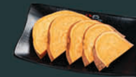
Sweet Potato [70] G