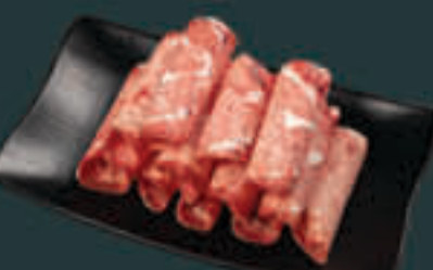
Beef Tongue [190] G Dinner Item