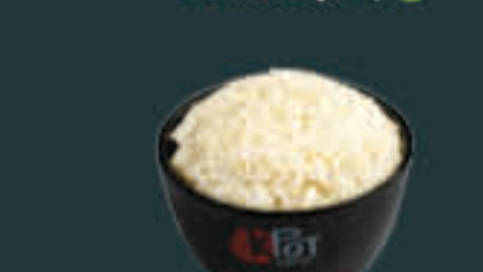
White Rice [110] G