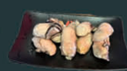
Oysters [60] G Dinner Item