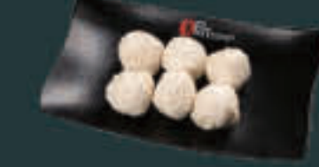
Cuttlefish Balls (150)