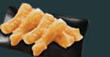
Fried Dough Stick (370)