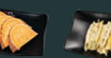
Sweet Potato (70) G