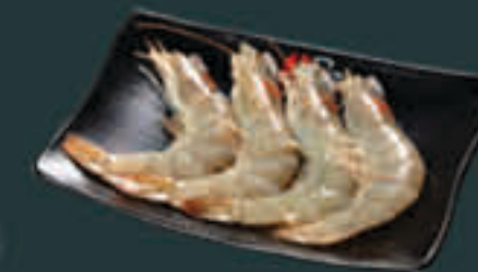
Jumbo Shrimp [90] G Dinner Item