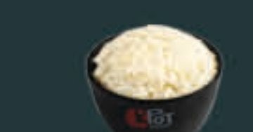
White Rice (110) G