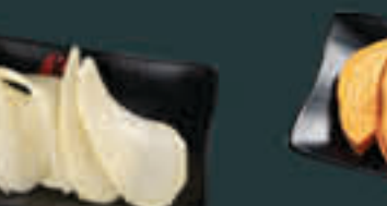
Potato (70) G