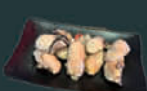
Oysters (60) G Dinner Item