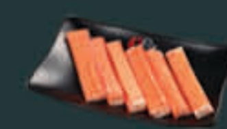
Crab Meat (90)