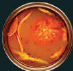
Thai Tom Yum