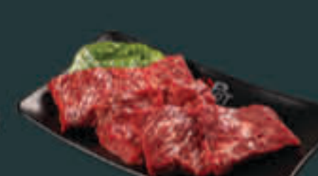
Hanger Steak [220] G Dinner Item