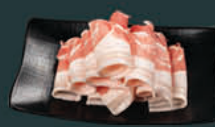
Sliced Pork Belly (330) G