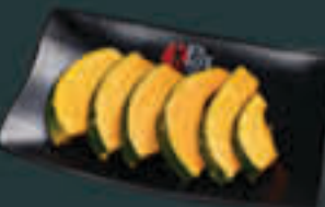
Sliced Pumpkins (20) G