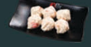
Lobster Balls (150)