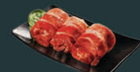
Spicy Pork Belly [330] Marinated pork belly with spicy sauce