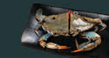
Blue Crab (60) G Dinner Item Seasonal