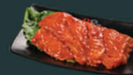
Spicy Salmon [170] Marinated salmon with spicy sauce Dinner Item