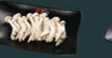
Beech Mushroom (15) G