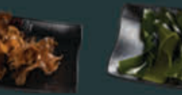
Black Fungus (25) G