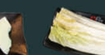
Winter Melon (10) G