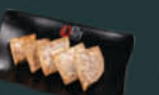
Fried Taro (180) G