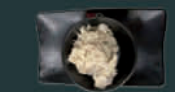
Shrimp Paste (75) Dinner Item