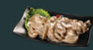
Baby Octopus (90) G