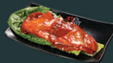
Spicy Calamari [110] Marinated calamari with spicy sauce