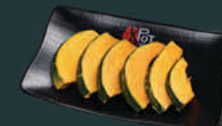
Pumpkin [20] G