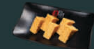
Fish Cakes (170)