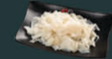
Cattle Tripe (70) G