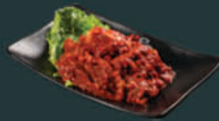
Spicy Beef Bulgogi [200] Marinated beef with spicy sauce