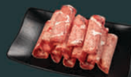
Beef Tongue (190) G Dinner Item