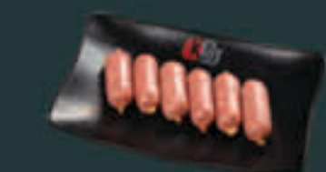
Mini Sausages (250)