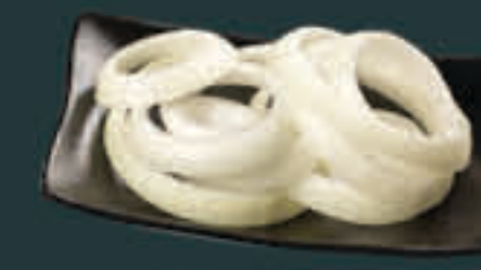
Onion [35] G