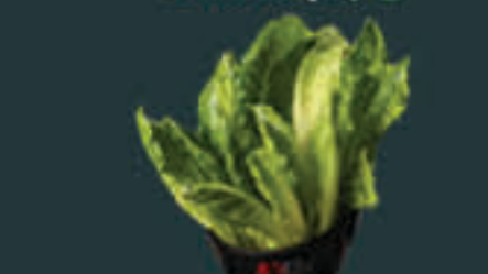
Green Leaf Lettuce [15] G