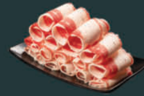
Sliced Beef Belly [360] G