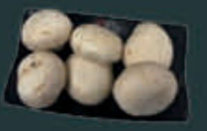
White Mushroom (10) G