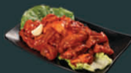
Spicy Chicken Bulgogi [130] Marinated chicken with spicy sauce