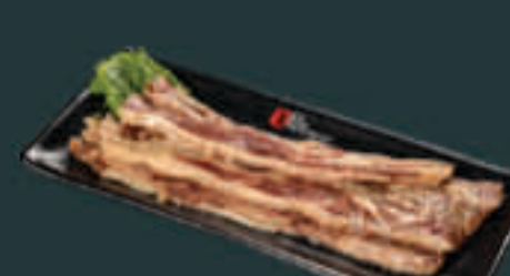
KPOT Short Rib [300] Marinated short rib Dinner Item