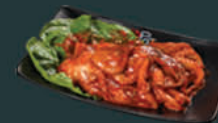
Spicy Baby Octopus [90] Marinated baby octopus with spicy sauce Dinner Item