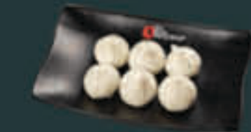
Fish Roe Balls (150) Dinner Item