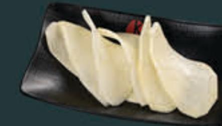
Potato [70] G