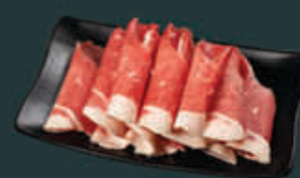
Prime Brisket (230) G