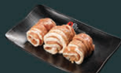
KPOT Pork Belly [340] Marinated premium pork belly