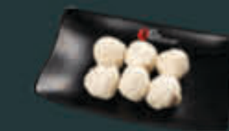
Fish Meatballs (140)