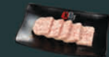
Spam (270) G