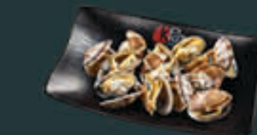
Clams (70) G