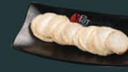
King Mushroom [20] G