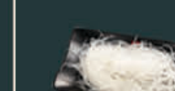
Mung Bean Sprout (25) G