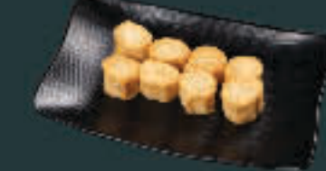
Fried Scallops (235)