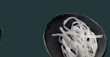
Mung Bean Wide Vermicelli (170) G