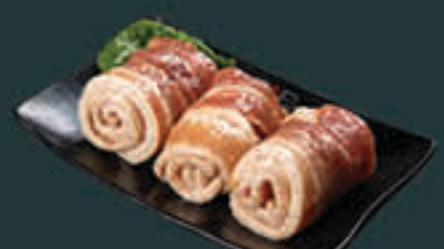
Smoked Garlic Pork Belly [320] Smoked & marinated pork belly with garlic sauce