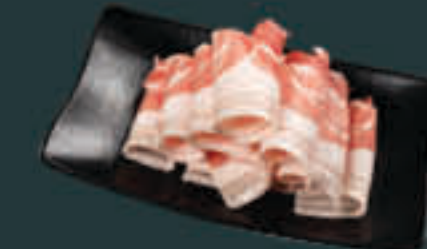
Sliced Pork Belly [330] G