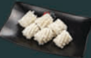
Squid (80) G