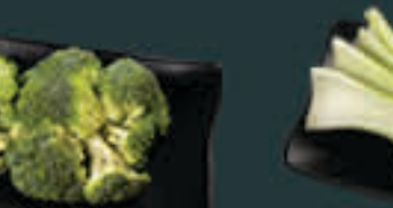
Broccoli (30) G