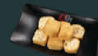
Fried Tofu (230) G