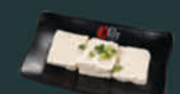
Soft Tofu (45) G