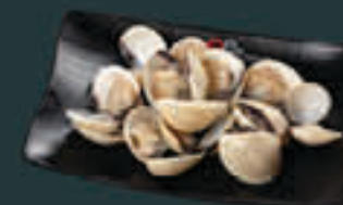
White Clams (70) G