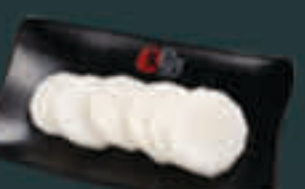
Daikon (15) G