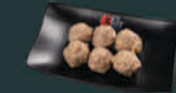
Beef Meatballs (220) Dinner Item