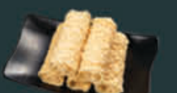
Fried Tofu Skin (270) G