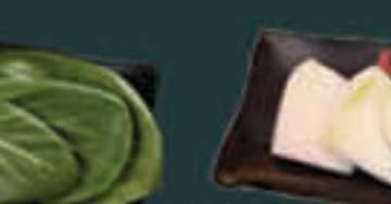
Bok Choy (10) G