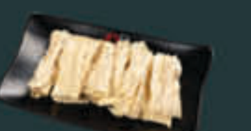
Bean Curd Stick (125) G