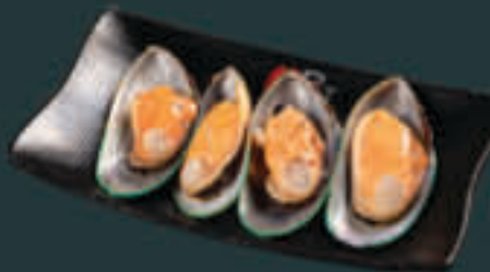
Mussels [80] G