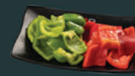
Pepper [25] G