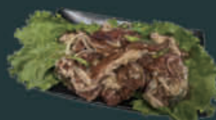
Sesame Beef Bulgogi [180]