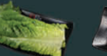
Green Leaf Lettuce (15) G