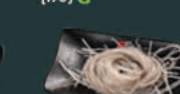
Sweet Potato Noodle (100) G