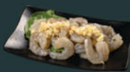
Garlic Shrimp [90] Marinated shrimp with garlic sauce