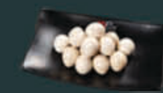
Quail Eggs (140) G