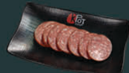
Kielbasa Sausage [286]