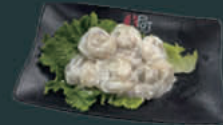
Coconut Shrimp [90] Marinated shrimp with coconut sauce