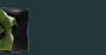
Seaweed Knots (20) G