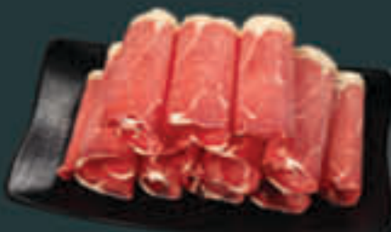
Sliced Lamb (100) G