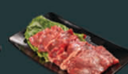
Angus Chuck Flap Tail [240] G Dinner Item