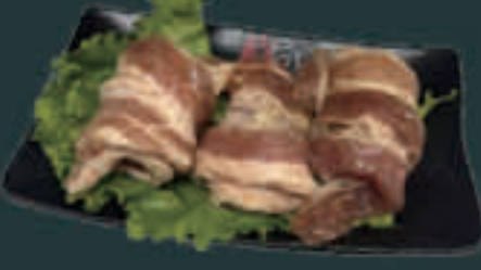
Miso Pork Belly [320]