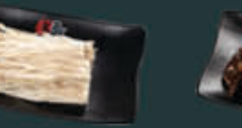
Enoki Mushroom (35) G