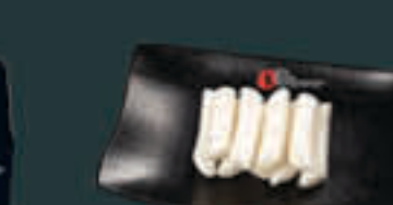
Rice Cake (330) G