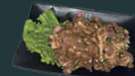
Cumin Lamb [557] Dinner Item