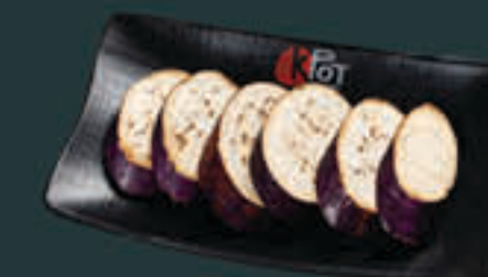
Eggplant [20] G