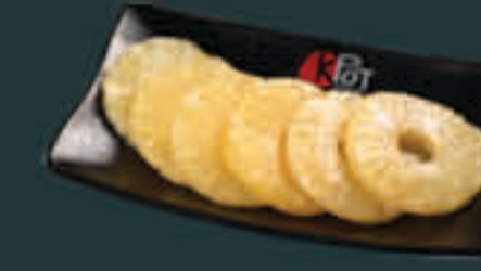
Pineapple [45] G