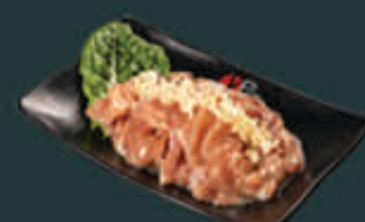
Garlic Chicken [150] Marinated chicken with garlic sauce