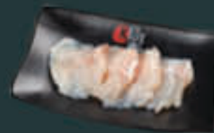
Swai Fish (80) G