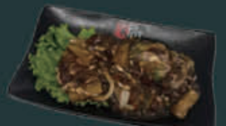
Hawaiian Beef Bulgogi [180]