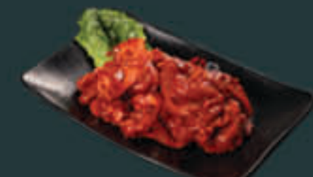
Spicy Pork Bulgogi [210] Marinated pork with spicy sauce