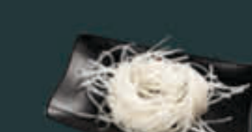
Fresh Pho Noodle (238) G