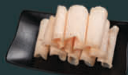
Sliced Chicken (100) G