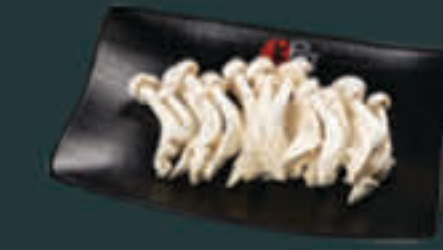
Beech Mushroom [15] G