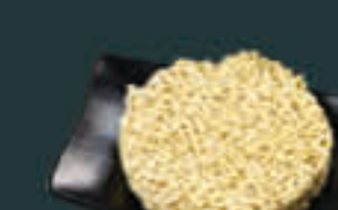
Ramen Noodle (370)