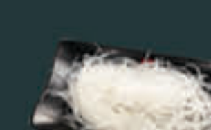
Vermicelli (95) G