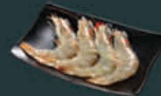
Jumbo Shrimp (90) G Dinner Item