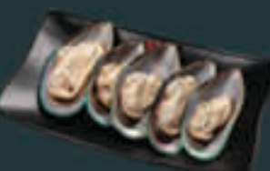
Mussels (80) G Dinner Item