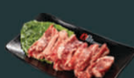
Fingers Ribs [240] G Dinner Item