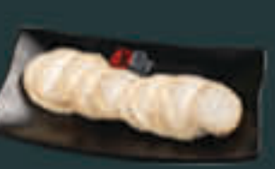
King Mushroom (20) G