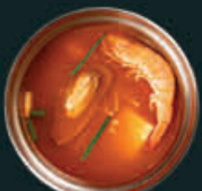
Korean Seafood Tofu