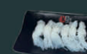
Yam Noodle (10) G