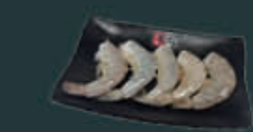
Headless Shrimp (90) G Dinner Item