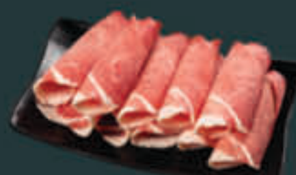
Sliced Ribeye (140) G Dinner Item