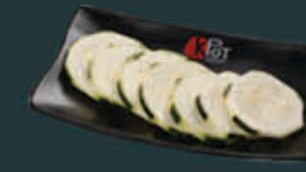
Zucchini [15] G