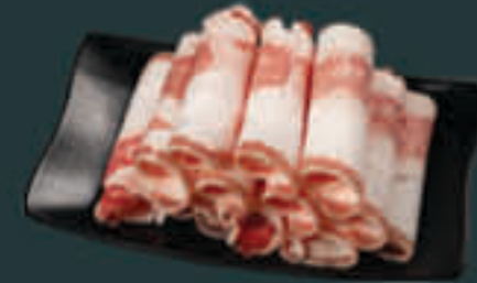
Sliced Beef Belly (360) G