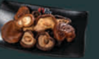
Shiitake Mushroom (30) G