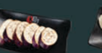
Eggplant (20) G