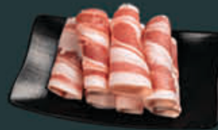
Sliced Pork (150) G