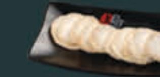
King Mushroom (20) G