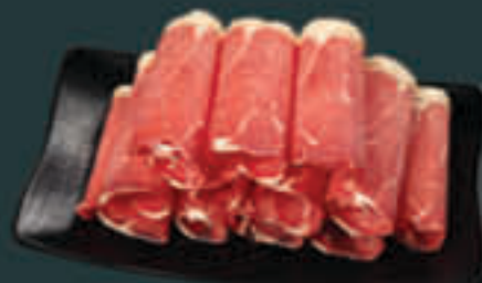
Sliced Lamb (100) G