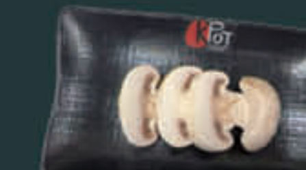
White Mushroom (20)