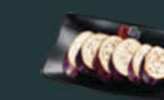
Eggplant (20) G