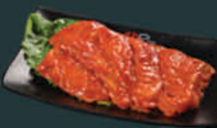
Spicy Salmon (170) Marinated salmon with spicy sauce Dinner Item