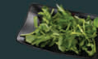
Watercress (10) G