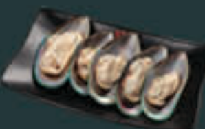
Mussels (80) G