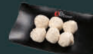
Cuttlefish Balls (150)