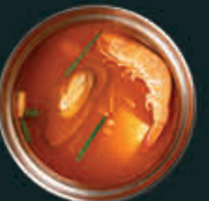
Korean Seafood Tofu