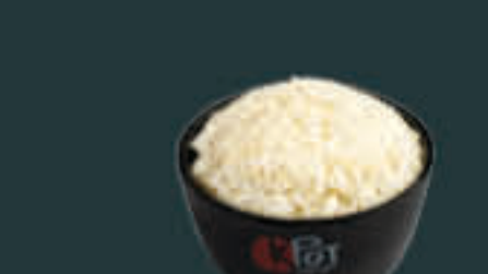
White Rice (110)