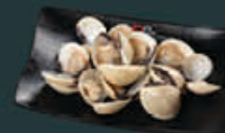
White Clams (70) G