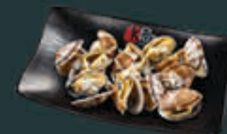
Clams (70) G