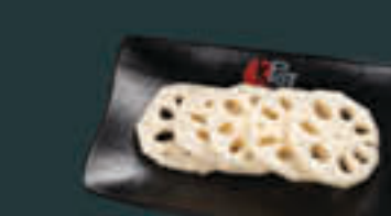
Lotus Root (60) G