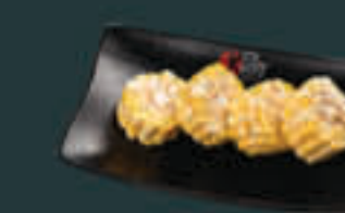
Corn (70) G