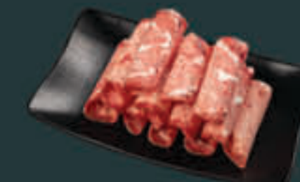
Beef Tongue (190) Dinner Item