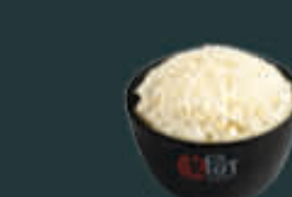
White Rice (110) G