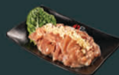
Garlic Chicken (150) Marinated chicken with garlic sauce