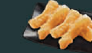
Fried Dough Stick (370)