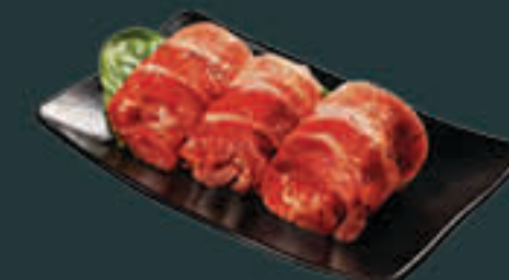
Spicy Pork Belly (330) Marinated pork belly with spicy sauce