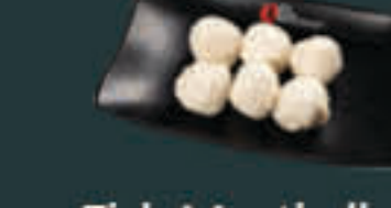
Fish Meatballs (140)