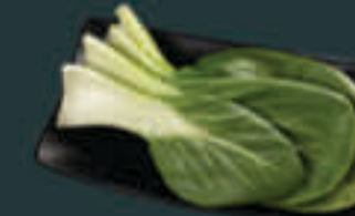
Bok Choy (10) G