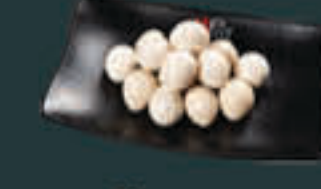
Quail Eggs (140) G