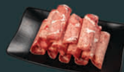
Beef Tongue (190) G Dinner Item