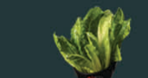
Green Leaf Lettuce (15)