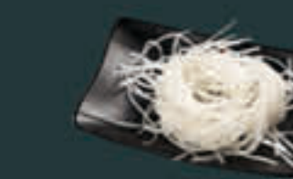
Fresh Pho Noodle (238) G