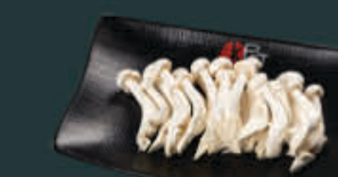
Beech Mushroom (15)