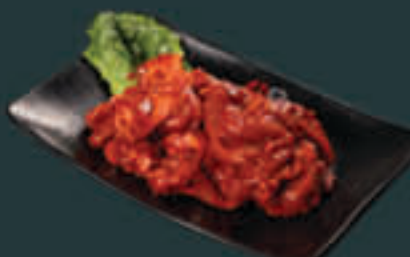
Spicy Pork Bulgogi (210) Marinated pork with spicy sauce