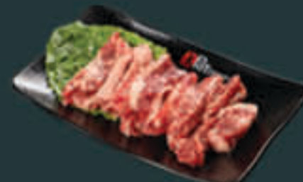
Fingers Ribs (240) Dinner Item