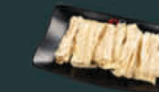
Bean Curd Stick (125) G