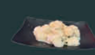
Garlic Scallop (90) Dinner Item