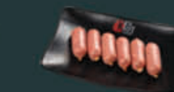
Mini Sausages (250)