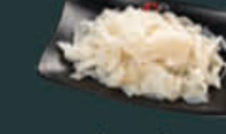
Cattle Tripe (70) G