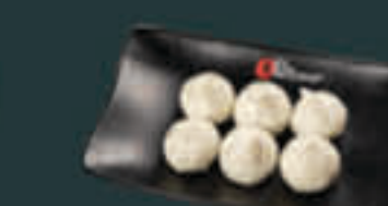
Fish Roe Balls (150) Dinner Item