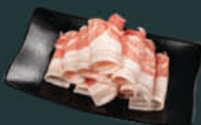
Sliced Pork Belly (330)