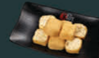
Fried Tofu (230) G