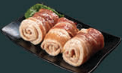
Smoked Garlic Pork Belly (320) Smoked & marinated pork belly with garlic sauce