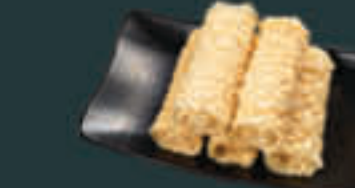
Fried Tofu Skin (270) G