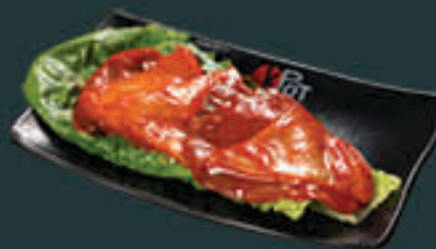
Spicy Calamari (110) Marinated calamari with spicy sauce