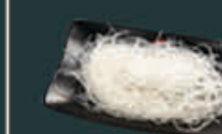
Vermicelli (95) G