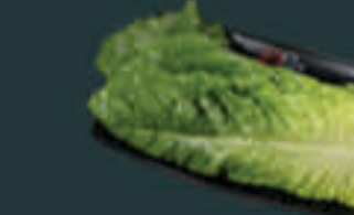
Green Leaf Lettuce (15) G