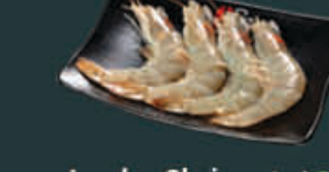
Jumbo Shrimp (90) Dinner Item