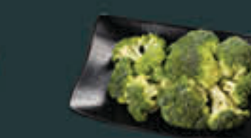
Broccoli (30) G