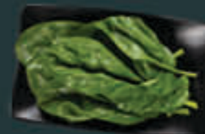
Spinach (20) G