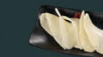
Potato (70) G