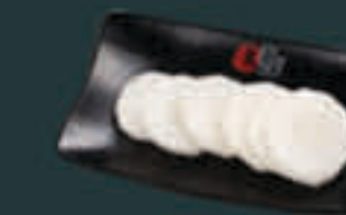
Daikon (15) G