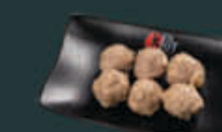
Beef Meatballs (220) Dinner Item