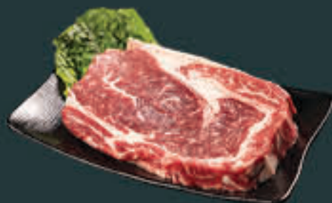
Kpot Steak (280) Dinner Item