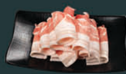
Sliced Pork Belly (330) G