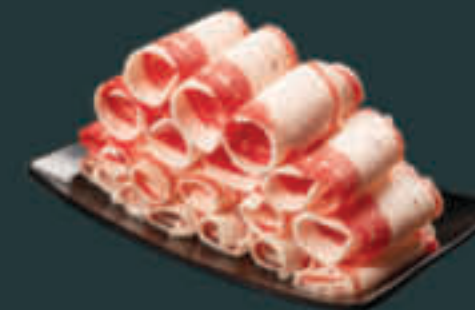
Sliced Beef Belly (360)