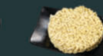
Ramen Noodle (370)