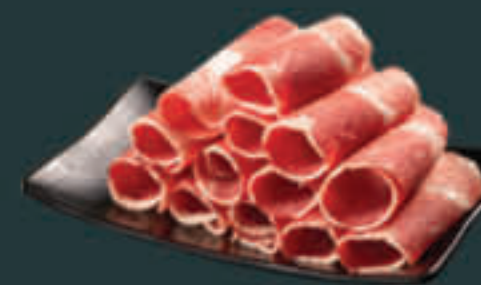
Prime Brisket (230)