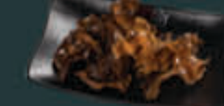
Black Fungus (25) G