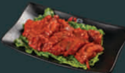
Spicy Fish Fillet (100) Marinated fish fillet with spicy sauce