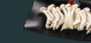
Beech Mushroom (15) G