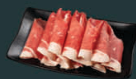
Prime Brisket (230) G