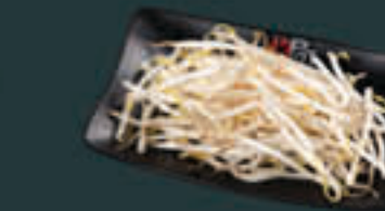
Mung Bean Sprout (25) G