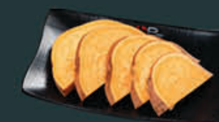
Sweet Potato (70)