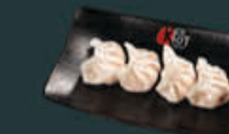
Shrimp Dumplings (170)