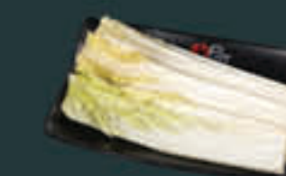
Napa (10) G