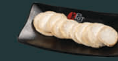
King Mushroom (20)