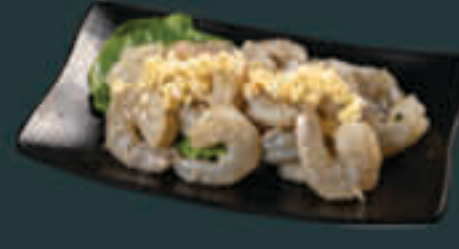
Garlic Shrimp (90) Marinated shrimp with garlic sauce