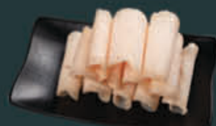
Sliced Chicken (100) G