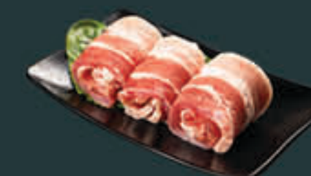
Pork Belly (330) Regular style sliced pork belly