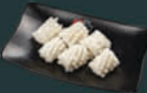
Squid (80) G