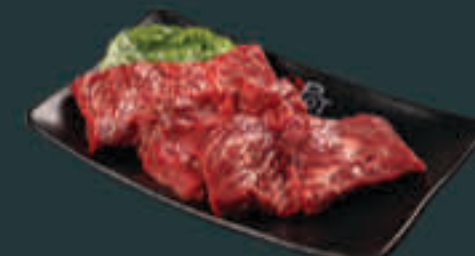
Hanger Steak (220) Dinner Item