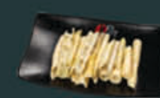
Baby Bamboo Shoot (25) G