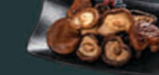
Shiitake Mushroom (30) G