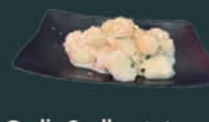
Garlic Scallop (90) Dinner Item