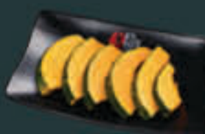
Sliced Pumpkins (20) G