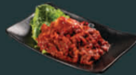
Spicy Beef Bulgogi (200) Marinated beef with spicy sauce