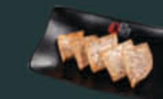
Fried Taro (180) G