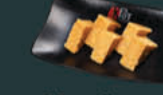
Fish Cakes (170)