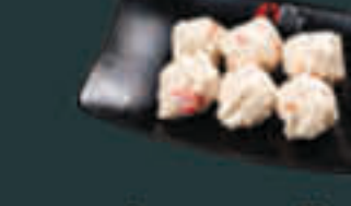
Lobster Balls (150)