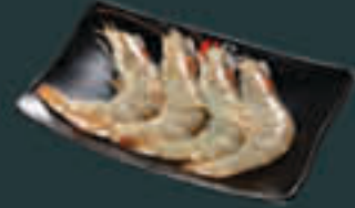
Jumbo Shrimp (90) G Dinner Item