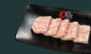
Spam (270) G