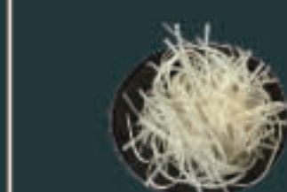
Thai Rice Stick (150) G