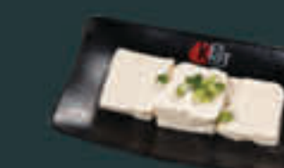
Soft Tofu (45) G