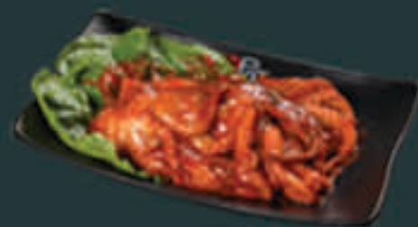
Spicy Baby Octopus (90) Marinated baby octopus with spicy sauce Dinner Item