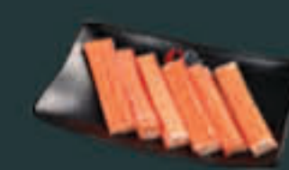
Krab Meat (90)