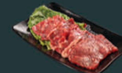
Angus Chuck Flap Tail (240) Dinner Item