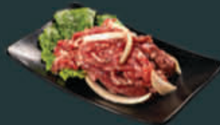
Beef Bulgogi (180) Marinated beef