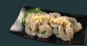
Garlic Shrimp (90)