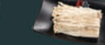
Enoki Mushroom (35) G