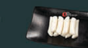
Rice Cake (330) G