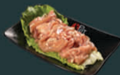
Chicken Bulgogi (120) Marinated chicken