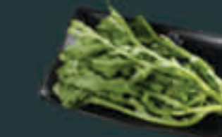
Crown Daisy (20) G