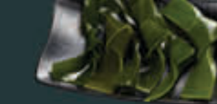
Seaweed Knots (20) G