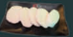
Yam (20) G