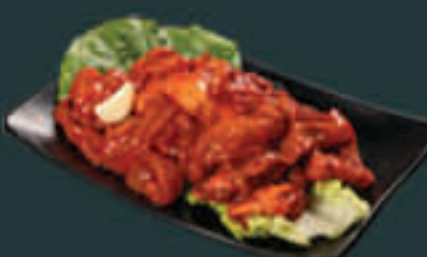
Spicy Chicken Bulgogi (130) Marinated chicken with spicy sauce