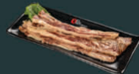
Kpot Short Rib (300) Marinated short rib Dinner Item