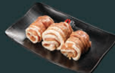
Kpot Pork Belly (340) Marinated premium pork belly