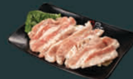
Signature Pork Cheek (220) Dinner Item