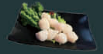
Scallops (90) G Dinner Item