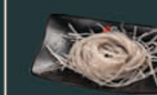
Sweet Potato Noodle (100) G