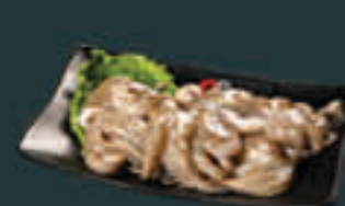
Baby Octopus (90) G Dinner Item